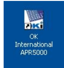
OKI Desktop icon

If current install is Metcal labeled version follow Section 1. If current install is OKI labeled version follow Section 2.